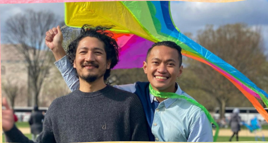
Cherry Blossom & Kite Festival