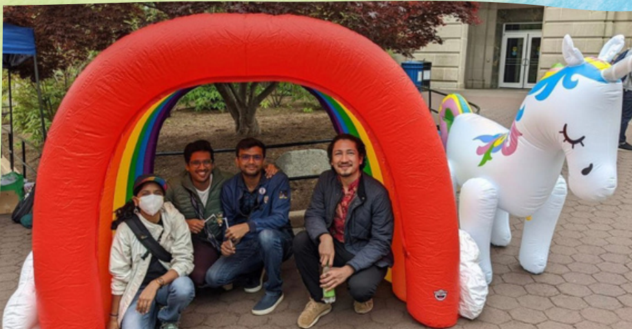
Gay Day at The Zoo